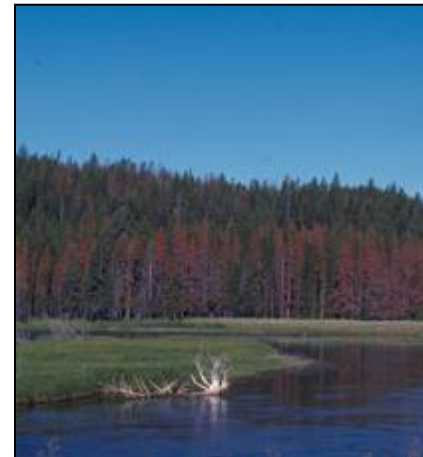
Jerald E. Dewey, USDA Forest Service

One of the indicators of reduced tree vigor is the insect epidemics are readily visible in many forested locations throughout the Rocky Mountains from Mexico north through Canada. Endemic (low-level) damage from insects and disease is common and natural in the forest. However, epidemic outbreaks involve larger areas, and result in more extensive decline, and the widespread death of trees. A great deal of research is underway on the current insect activity—for example, of bark-beetle infestations. Yet little can be done to stop a bark-beetle outbreak that is in progress. Colorado alone has seen 3.5 million acres (5468 square miles) affected by Mountain Pine Beetle as of 2011, according to the Colorado State Forest Service (2011 Forest Health Aerial Survey Results, CSFS). The problem is widespread.